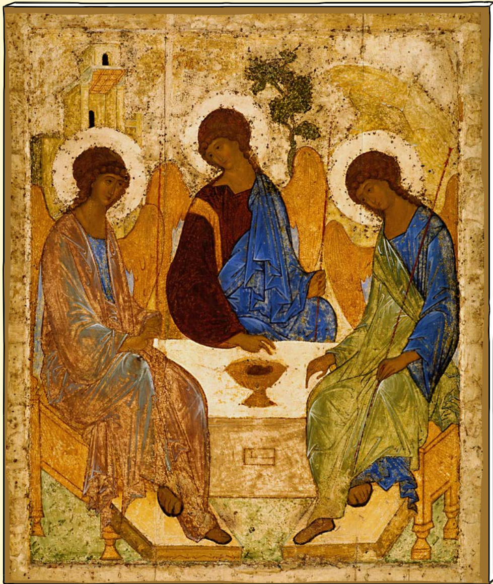
The Trinity Icon